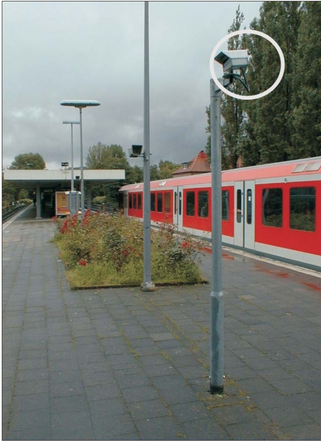
Fig. 1 • Infrared presence detektor FLG 10-20

In connection with the implementation of "SAT" (self-dispatch by railcar drivers) at Hamburger S-Bahn GmbH, there are used FLG 10 units in order to detect, during the entry of trains into the platform area, any full-length trains that by mistake stop at the stop sign for half-length trains. The same applies to half-length trains that stop too far before the stop sign.